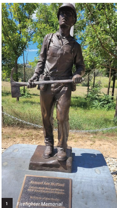
1 Firefighter Memorial

For more information on the support program, please visit: https://www.service.nsw.gov.au