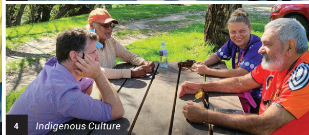
4 Indigenous Culture