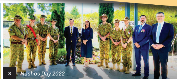
3 Nashos Day 2022