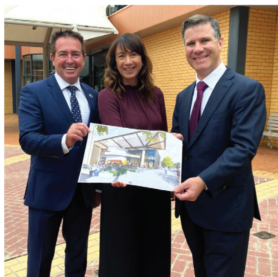
With Deputy Premier Paul Toole and Albury Mayor Kylie King